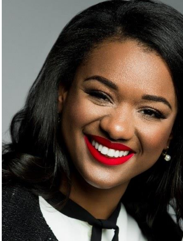
2 - Trillion Small

There is no “I” in Team...but there is one in Leadership. Effectively leading others begins with effectively leading yourself. Self-leadership is the key to completely transforming the life of your team, organization, and school from the inside-out. As education continues to transform, so will the need for your style and structure of leadership. The depth of the needs of your students are changing as well, so is your leadership and the overall leadership of your school sufficient to meet these demands? Join this discussion to learn just how significant, imperative, and valuable YOU are to your students and school.