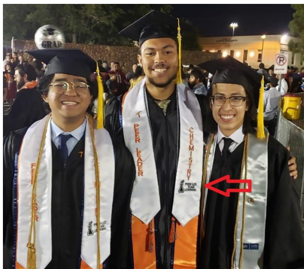
1 - UTEP Peer leaders wearing their PLTL stoles.

UTEP Peer leaders wearing their PLTL stoles (designated with a red arrow) at their commencement ceremony.