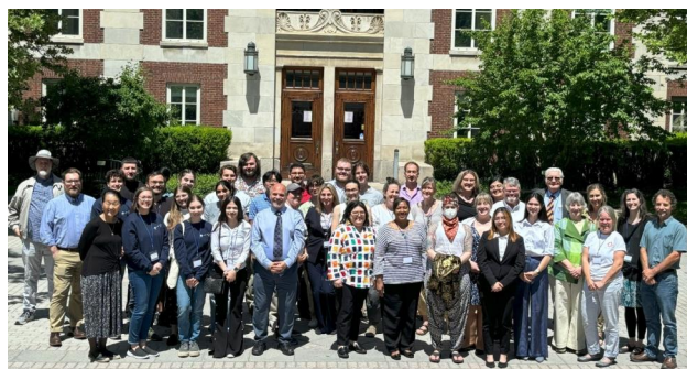
9 - Saturday, June 1