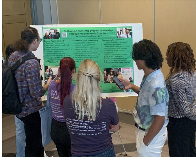
7 - Posters! Discussion!