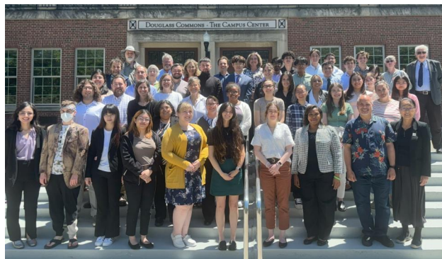
8 - Friday, May 31