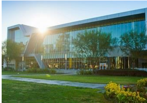
1 - California State University Dominguez Hills

Wednesday – Saturday, May 28-May 31, 2025